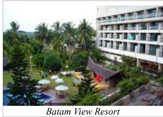
Batam View Resort