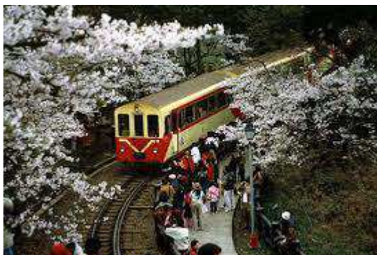
Alishan National Park