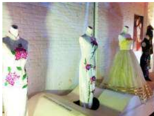
Teresa Teng Memorial Hall